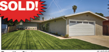
Turn-Key Starter #4985 Sold with multiple offers! 3 bedrooms, 2 baths, just over 1,800 sq.ft. New kitchen and bathrooms.