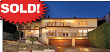
Rimcrest Remodeled Tri-Level #6015 Great Downtown LA views, 6 bedrooms, 4,259 sq.ft. Custom kitchen and multiple balconies -- $1,360,000