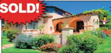
Prime Rossmoyne Spanish #4985 Our buyer stole this at $367/square foot. 4 bedrooms and 4 baths with character throughout -- $1,070,000