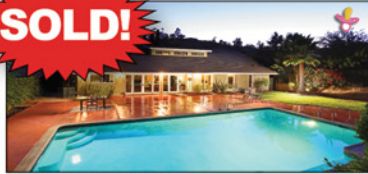
Greenbriar Cul-de-Sac #6005 Under contract in 7 days. 7 Bedrooms/4 Baths Listed and sold with multiple offers -- $1,295,000