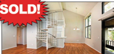
Starter 2 story townhome #4985 Elegance and charm in one. New floors and paint. Sold in less than a week -- $395,000