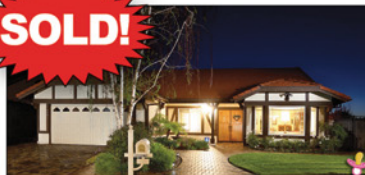
Private cul-de-sac Traditional #5085 Multiple offers!! 4 Bedrooms, 2 bath in Oakridge Estates. Amazing views and privacy $725,000