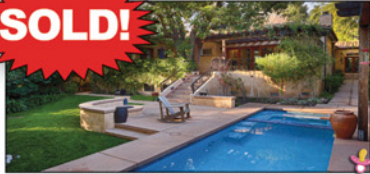
Verdugo Woodlands Upgraded Spanish #5075 Completely remodeled throughout. 2,638 sq.ft. with 3 bedrooms. Listed and Sold in 3 days -- $1,200,000