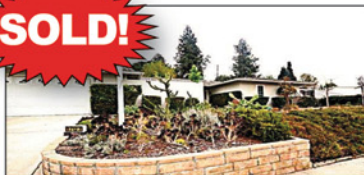
Turn-key Traditional #4985 3 bedroom/2bath with 1,600 square feet of living space. Our buyer stole it w/ multiple offers - $532,000