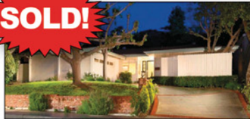
Montecito Park Gem #5075 Never made it on the market. 3 bedrooms/2 baths with upgrades. Listed/sold over asking-- $830,000