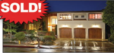
Emerald Isle -- Prime Location! #5995 5 Bedrooms/5 Baths with 4,300 sq.ft. Large open floor plan and high ceilings --- $1,170,000