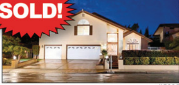
Emerald Isle Fixer #5095 Previously listed for 5 months -- no luck! We got the job done with multiple offers -- $1,150,000