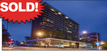
Monterey Island with Views #6075 Luxurious condo highrise boast all the qualities you can ever ask for. Listed and Sold -- $650,000