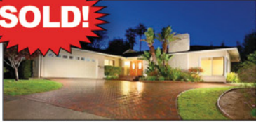
Greenbriar Privacy #5125 Gated residence with 4 bedrooms with nearly 2,000 sq.ft. Upgraded kitchen and baths. Sold privately $862,000!