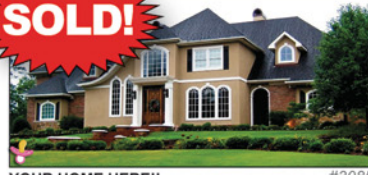
YOUR HOME HERE!! #3085 Want to have your home privately sold for TOP DOLLAR? We may already have your buyer. Call 818-244-2939 to find out more TODAY!!

Want to get more details on these homes. Call 800-522-1803 and enter the appropriate extension