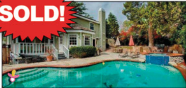
La Crescenta Privacy #4985 Gated residence with 4 bedrooms/3 baths. Gourmet kitchen and much more. $1,325,000