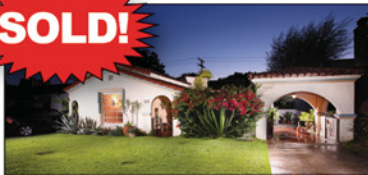
Rossmoyne Spanish Starter #5025 Character galore! 3 bedrooms, 2 baths and finished garage with loads of features -- $683,000