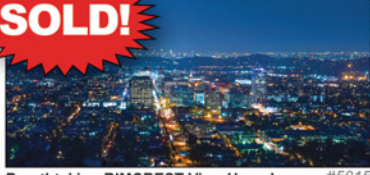
Breathtaking RIMCREST View Home! #5015 Large open living room and family room. Great for entertaining. Sold at $1,300,000 in one week!