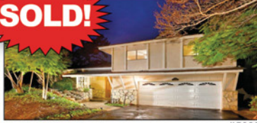
Verdugo Woodlands #5085 First time on the market in decades. Sold over asking price (AS IS) $760,000