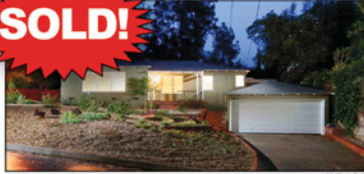
Glenoaks Canyon Gem #5135 2 bedrooms, 1 bath. 1,320 sq.ft. Never even made it on the market. Listed & Sold for $595,000