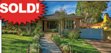
Verdugo Woodlands Treasure #5155 3 Bedrooms/2 Baths with loads of curb appeal. Sold in seconds/multiple offers over asking -- $800,000