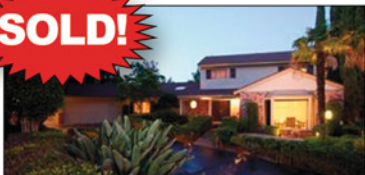
Melwood/Greenbriar Hideaway #5165 Privacy 3 bedroom on a private driveway. Needs a ton TLC but in a great location. Sold Full Price-- $895,000