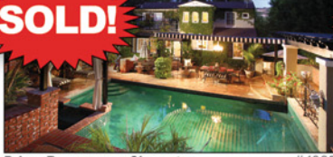
Prime Rossmoyne Character #4985 4 Bedrooms with 2,600 square feet. Enchanting yard with pool. Privately listed and sold -- $1,000,000