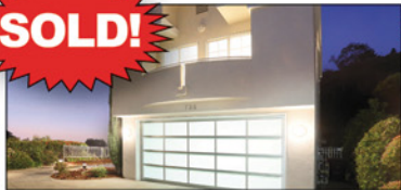
Chevy Chase View Home #5045 Private driveway with 4 Bd/4 Ba and 2,600 sq.ft. New kitchen and stunning yard with view -- $1,050,000