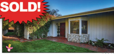
Glenoaks Canyon with Views #6045 2 Bedrooms/2 Baths with 1,300 sq.ft. on a private driveway and views. Multiple offers at $700,000.

Want to get more details about these homes. Call 800-522-1803 and enter the appropriate extension