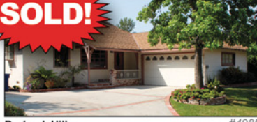
Burbank Hills #4985 3 Bedrooms with 2 bathrooms. Never made it on the market. We closed escrow ALL CASH!