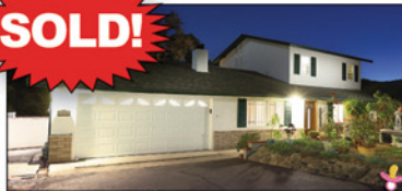
La Crescenta/Glendale #6035 4 Bedroom/3 Bath remodeled home. We sold in less than one month with multiple offers -- $808,000