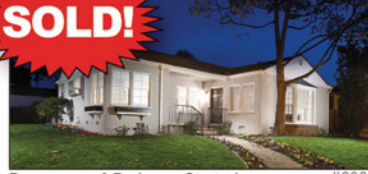
Rossmoyne 3 Bedroom Starter! #6065 Features large open living room with gracious wood floors and upgraded bathroom and dining room!