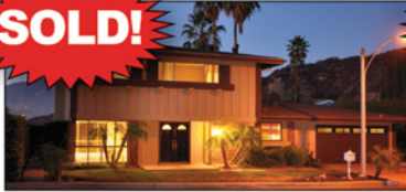
Verdugo Woodlands View Home #6025 Listed previously for 9 months -- No Luck. We got the job done in only one week!