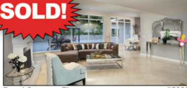
Royal Canyons Elegance #5035 Turn-key 4 bedroom home quietly tucked away in a private cul-de-sac. Sold w/ multiple offers - $995,000!