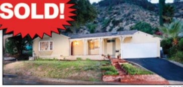
Verdugo Woodlands Charmer #5115 2 Bedrooms/2 Baths. Previously listed for 6 months. We got the job done in weeks! $650,000