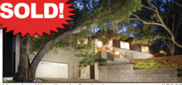
Verdugo Woodlands Seclusion #5065 Quiet & serene with 3 bedrooms, 3 baths, with 2,400 square feet and private lot -- Listed/Sold $795,000!