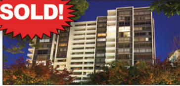
Park Towers -- Ground Level #6085 Listed with a previous Realtor with no luck. We got the job done with multiple offers!